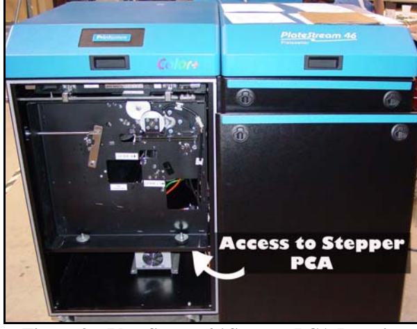
Figure 3 – PlateStream46 Stepper PCA Location