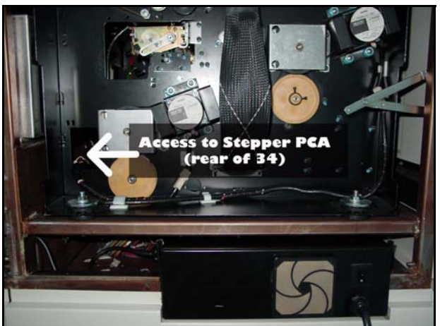
Figure 2 - PlateStream34 Stepper PCA Location